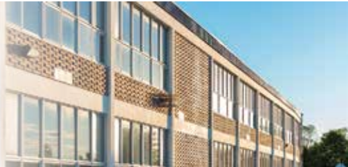
0-1 YEARS HIGH SCHOOL (COMPLETE AT LEAST 9TH GRADE)