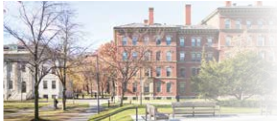
4 YEARS UNIVERSITY