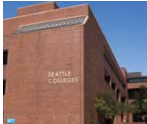
"2 YEARS + 2 YEARS" SEATTLE COLLEGES UNIVERSITY HS DIPLOMA + ASSOCIATE DEGREE