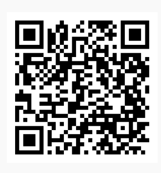
Scan the QR code and select your campus to access the PDFs.