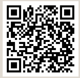
Scan the QR code and select your campus to access the PDFs.

Before you send an email to International Programs, please refer to the PDFs labeled 'Student Life', 'Academics', and 'Immigration' to find answers to commonly asked questions.